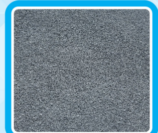
6 mm Metal ( 1/4" Jally )