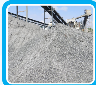
C Sand (Concrete Sand)