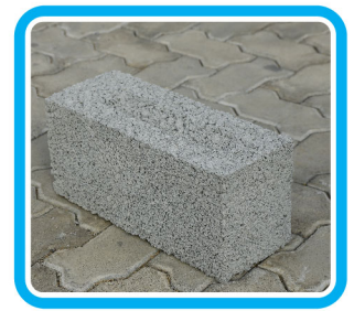
6" Solid Block