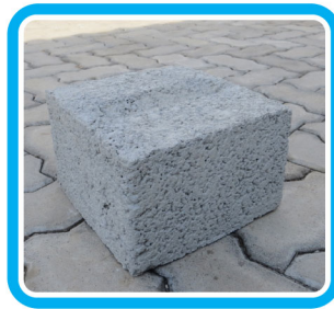
9" Solid Block