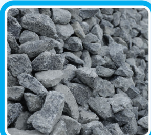
40 mm Metal ( 1 1/2" Jally )