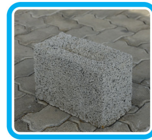
6" Solid Block