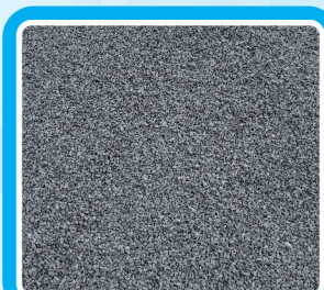
12 mm Metal ( 1/2" Jally )