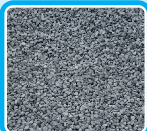
20 mm Metal ( 3/4" Jally )