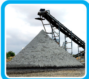
P Sand (Plastering Sand)