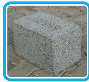
8" Solid Block