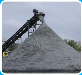
M Sand (Manufactured Sand)