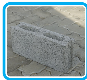
4" Hollow Block