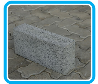
4" Solid Block