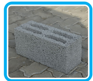
6" Hollow Block