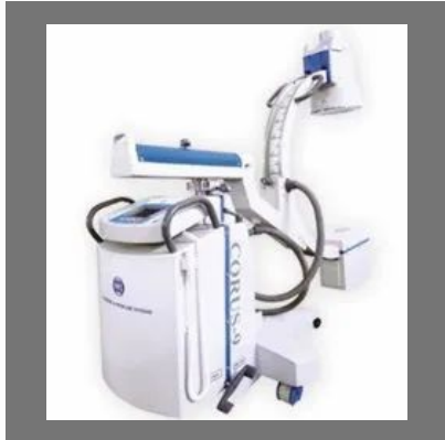
RMS Corus 6 and Corus 9 High Frequency C-Arm Machine