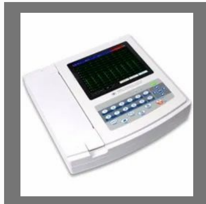
RMS Vesta 12EC 12 Channel ECG Machine