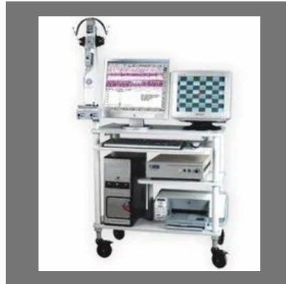
RMS Aleron 201/401 2/4 Channel EMG Machine