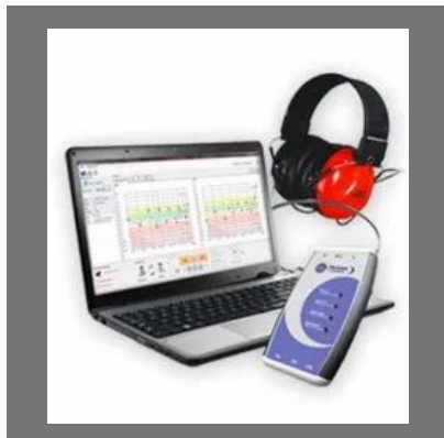
RMS Hermes PC Based Audiometer