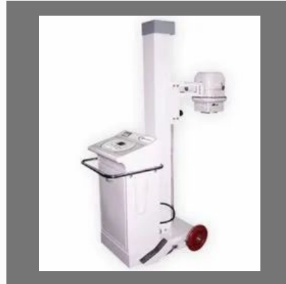
RMS MDX-100 DX 100mA with Anatomical Programs Mobile X-Ray Machine