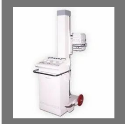
RMS MDX-100 100 mA, 100 KVP Mobile X-Ray Machine