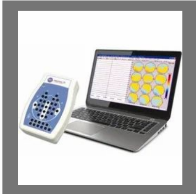
RMS Maximus 24/32 Portable EEG Machine