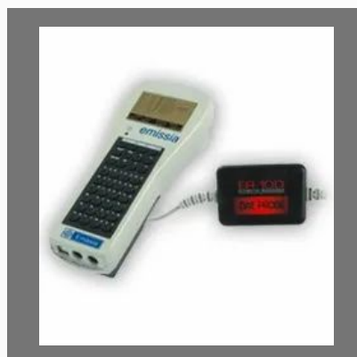
RMS Emissia OTO Acoustic Emissions