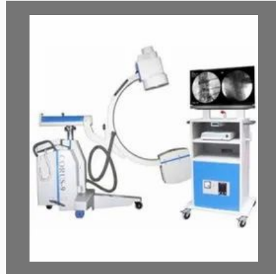
RMS Corus 9 HD High Frequency HD C-Arm Machine