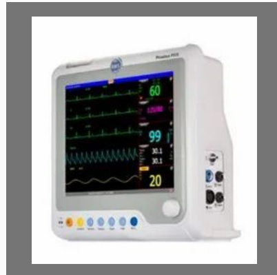
RMS Phoebus P515 Patient Monitoring System