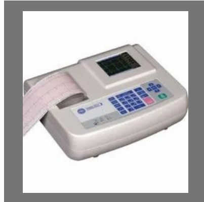
RMS Vesta 301i 3 Channel ECG Machine