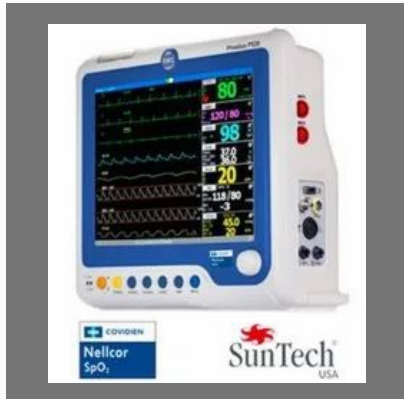
RMS Phoebus P529 Patient Monitoring System