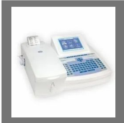
RMS Analytica Biochemistry Analyzer