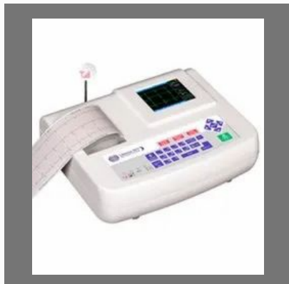
RMS Ulterius 501 Tele ECG System