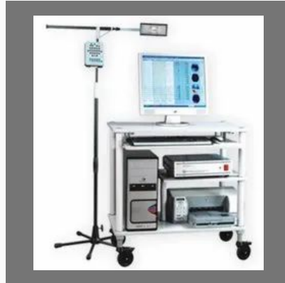
RMS Brain View Plus 24 Channel EEG Machine