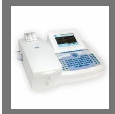
RMS Analytical 705 Biochemistry Analyzer