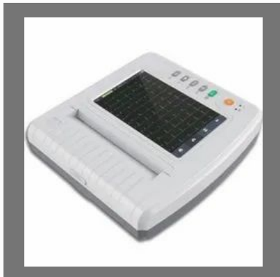
RMS Vesta 12C 12 Channel ECG Machine