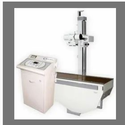
RMS MDX-100 R 100 ma, 100 KVP With Rotating Anode Tube Fixed X-Ray Machine