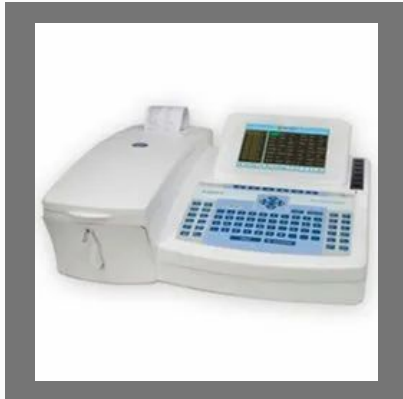
RMS Analytica 705i with Dry Bath Incubator Biochemistry Analyzer