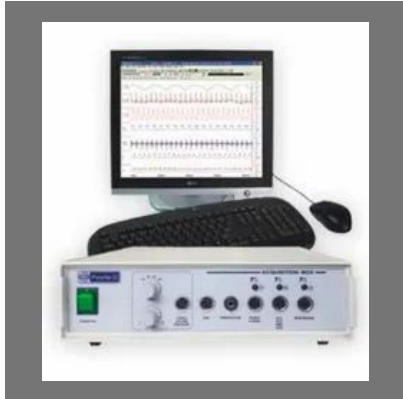
RMS Ecton/PC Ecton ECT Electroconvulsive Therapy Machine