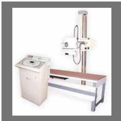
RMS MDX-100/FS 100 mA 100 KVP Fixed X-Ray Machine