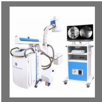
RMS Corus 9 HD 1K High Frequency 1K x 1K HD Imaging Chain C-Arm Machine