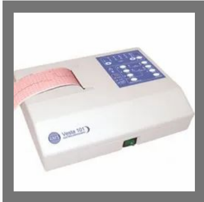
RMS Vesta 101 Single Channel ECG Machine