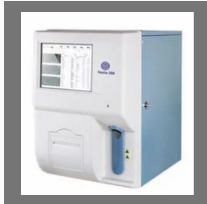
RMS Hestia 360 3 Part Auto Hematology Analyzer