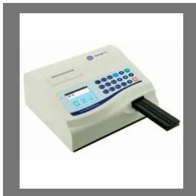
RMS Orina EC Urine Strip Analyzer