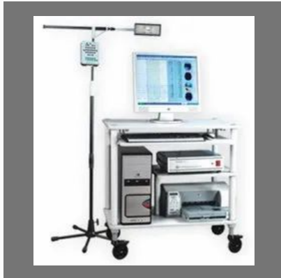
RMS Super Spec 32 Channel EEG Machine