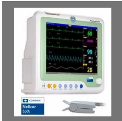
RMS Phoebus P512 Multipara Patient Monitor