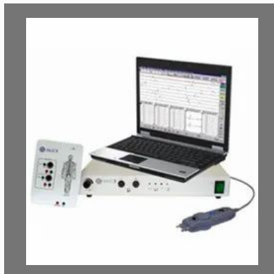
RMS Salus 2C/4C Channel Portable EMG Machine