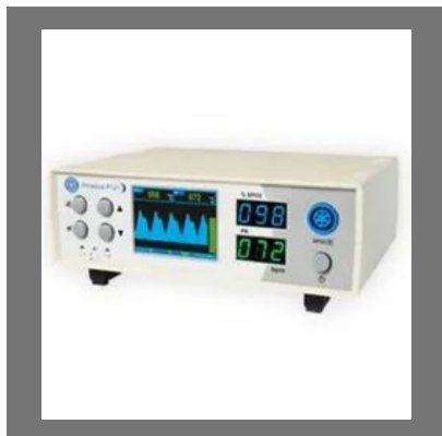
RMS Phoebus P121 Pulse Oximeter Single Para Monitor