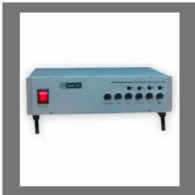
RMS Relax 701 Advanced Bio-Feedback System