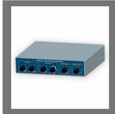
RMS Quadramind MBT-Multi Behavior Therapy Machine