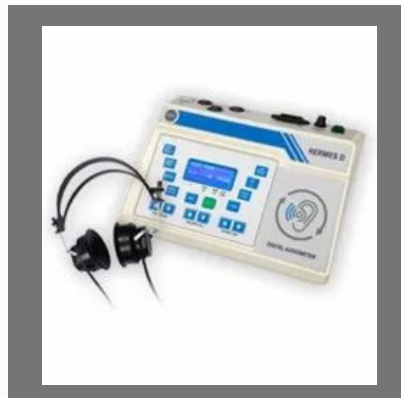
RMS Hermes D Audiometer