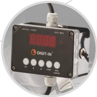
Digital Timer with inbuilt Hour Counter