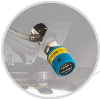
SS316 Grade Flow Control Mechanism