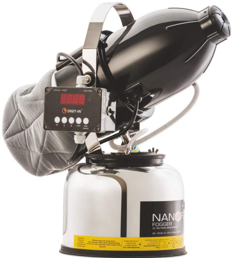
3018 SFD / 3020 SD