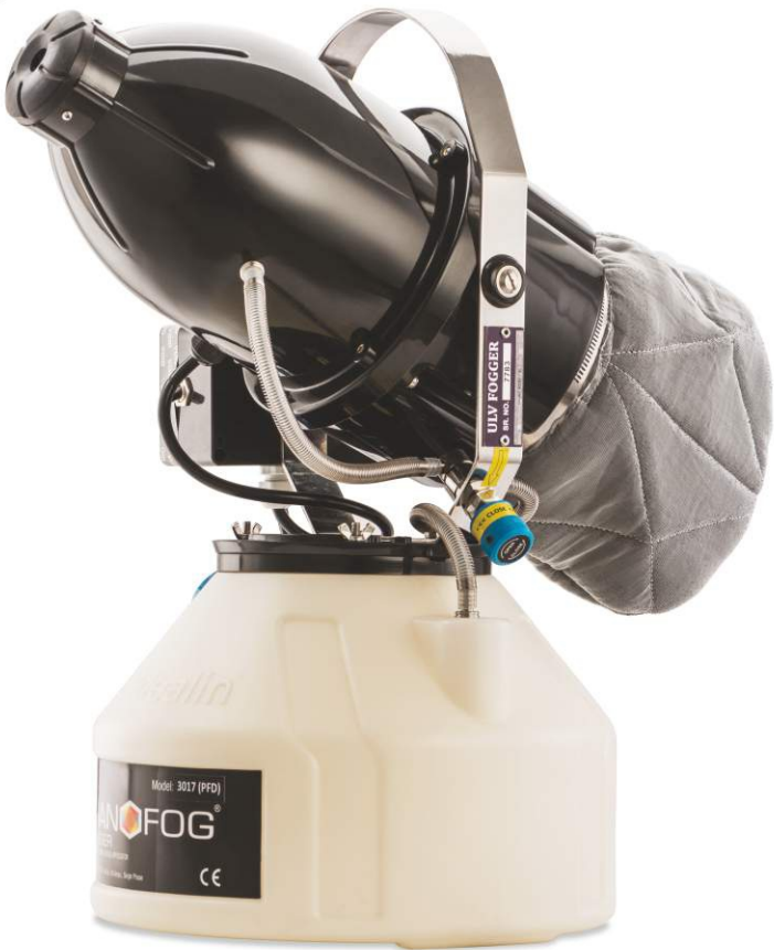
3017 PFD / 3019 PD