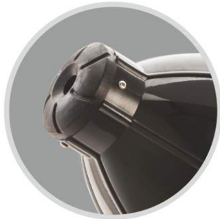
Advance Thrust Design Air-Jet Nozzle