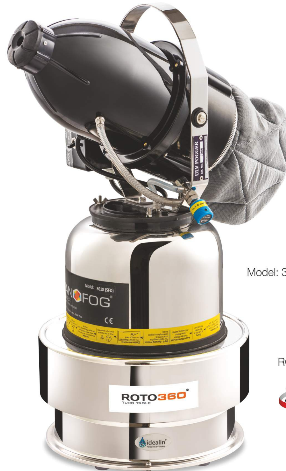
Model: 3018 SFD